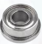
» Flange Miniature Bearings