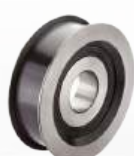
» Forklift Bearings