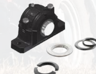
› Plummer Seals & Rings