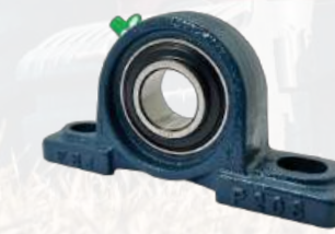
› Pillow Block Units