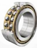
» Double-Row Angular Contact Ball Bearings