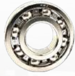
» Gearbox Bearings