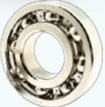
» Deep Groove Ball Bearings