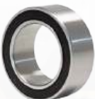
» Aircon Magnetic Bearings