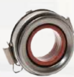
» Clutch Release Bearings