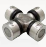
» Universal Ball Joints