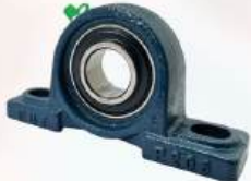
» Pillow Blocks