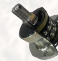
› Agri Hub Bearings