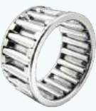
» Needle Roller Bearings