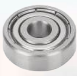
» Stainless Steel Bearings