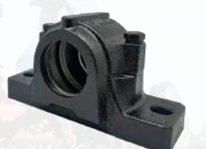
› Plummer Block Housings