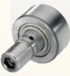
» Cam Follower Ball Bearings