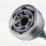
» Velocity Joints