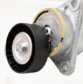
» Tensioners & Pulleys