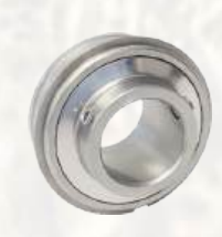
› Bearing Inserts