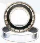
» Tapered Roller Bearings

Our robust infrastructure supports high-volume inventory, enabling rapid and reliable order fulfillment.