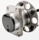
» Wheel Hub Bearings