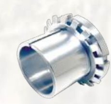
› Adapter Sleeves