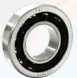
» Angular Contact Ball Bearings