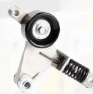
» Fan Belt Tensioners