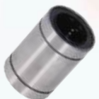
» Linear Motion Bearings