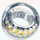
» Spherical Roller Bearings